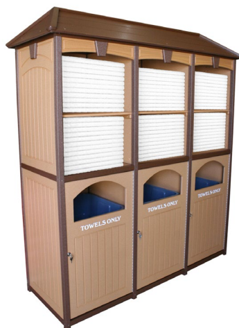
TOWERS (MODULAR 1, 2, OR 3)

Superior performance in all water areas!