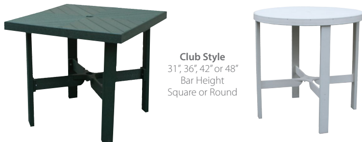
Club Style 31", 36", 42" or 48" Bar Height Square or Round