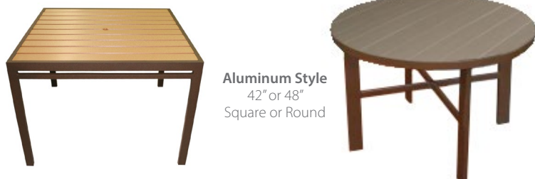
Aluminum Style 42" or 48" Square or Round