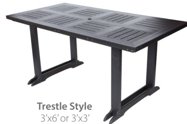
Trestle Style 3'x6' or 3'x3'

Why Eagle One's 100% GreenWood® recycled HDPE site furnishings provide superior performance benefits over traditional outdoor materials: