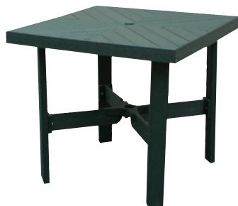
Club Style 31", 36", 42" or 48" Bar Height Square or Round