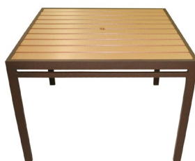
Aluminum Style 42" or 48" Square or Round