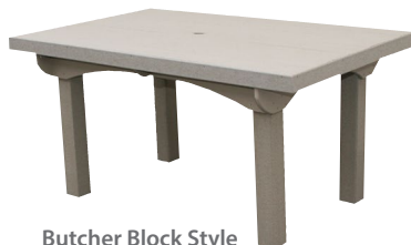
Butcher Block Style 42" or 60" Square or Round