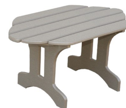
C4235 Adirondack Side Table 20"x19"x16"