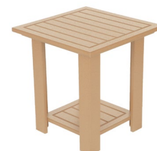
C417 Lexington Side Table 19"x19"x18"