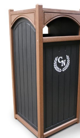
TRASH & RECYCLE RECEPTACLES