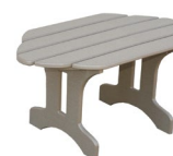
CHAISE LOUNGES & SIDE TABLES